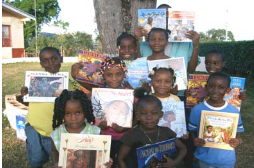
Children with donated books Resource District Jamaica