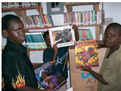
Children sorting boxes Allen-Shaw Reading Room Resource District