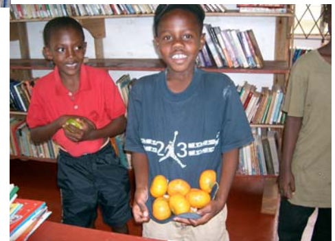
Tangerine Boys-trees loaded with the sweet fruit grows behind the Library