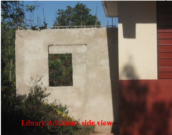
Library Addition- side view

Either, way, cement and steel are, cemented! The plans started several years ago when I began a Building Fund Drive and even though I didn't meet my fundraising goal, donations were enough to purchase blocks which we used as seats while we waited. So onward with another phase of fundraising, because I think a roof is an excellent idea, not to mention windows, doors and floors. It is my desire to have a storage area for the multitude of books donated to the Foundation along with a multi-purpose room which will serve as a literacy center for our Community. With more space we will be able to secure more computers to add more internet access.