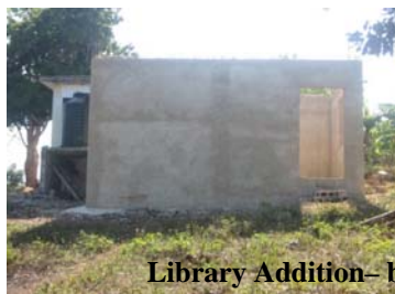
Library Addition- back view