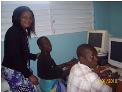
Cornel University Student with computer donations @ Mannings Boys Home

We worked with the student group Jamaica Difference from Cornell University, to arrange the donation of six computers to the Manning Boys Home. We also worked with a corporate sponsor to secure a printer. These donations will assist the home in the development of their computer lab.