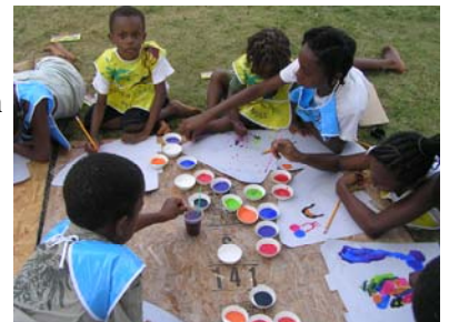
The Cheeky One with his creation!

it was worth it. I think we had some Jackson Pollock in the making. I don't know who taught them how to splash paint on a canvas. But splash and drip they did and their abstract expressions, turned me into a pilferer because I have them all. They will be displayed at our Summer School/Camp 2010